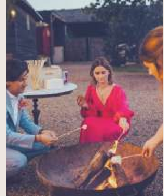
Fire Bowl & S'mors