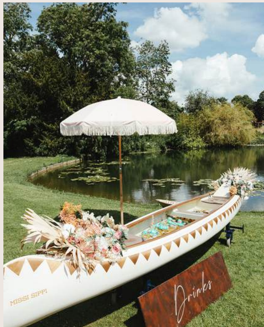
Missisipi Drinks Canoe & Ice