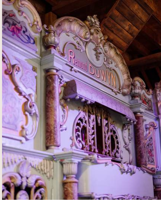
The Musical Organ and Door Show