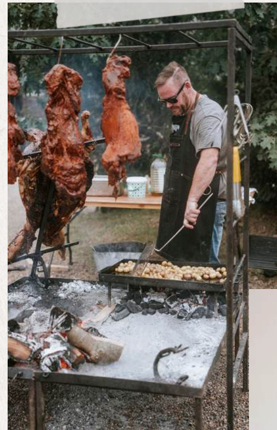
Game & Flames