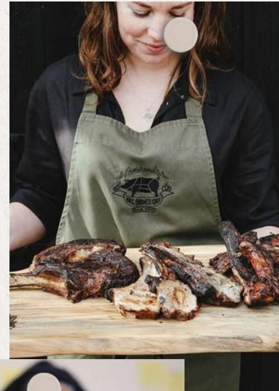
Fern & Farrow