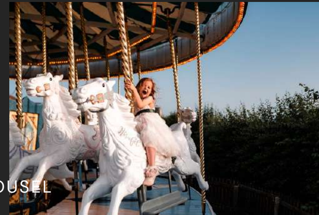
HIRE OF THE VICTORIAN CAROUSEL

Use of our wonderful Victorian carousel all day and evening until 9.30pm. Our Ride Master will invite you to take rides all day, ensuring fun for absolutely everyone.